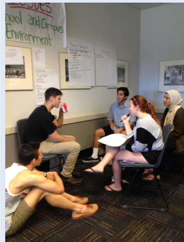
AS-Sponsored All-School Strategic Plan Forum April 11, 2014

The Guiding Group with a group of other interested AS participants, with full results from the surveys and the forum in hand, set goals that reflected the voices of undergrads and AS participants.