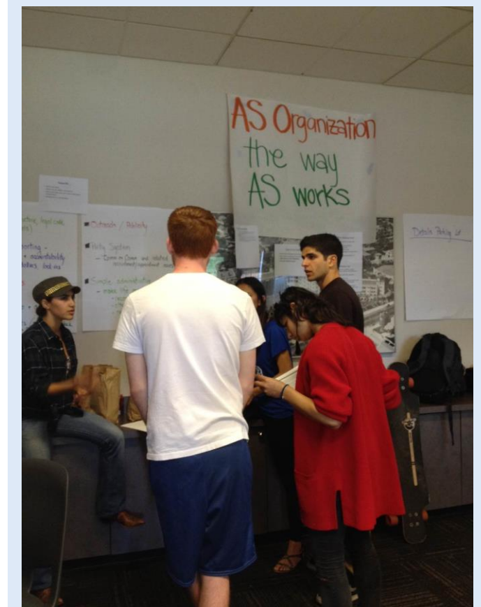
AS-Sponsored All-School Strategic Plan Forum April 11, 2014